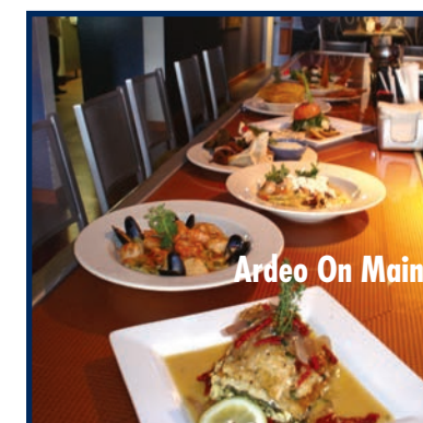
Ardeo On Main

"Our celebration was a perfect, flawless occasion. Your food was phenomenal! Everyone has complimented on how they loved the food."