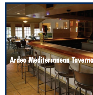
Ardeo Mediterranean Taverna